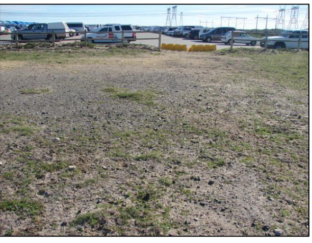
View towards the north of the area adjoining the existing car park.