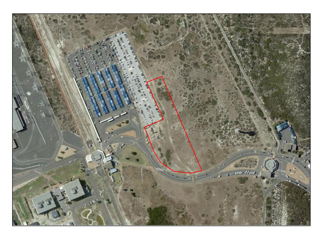
Aerial view showing the location of the study area for the proposed new car park (red polygon).