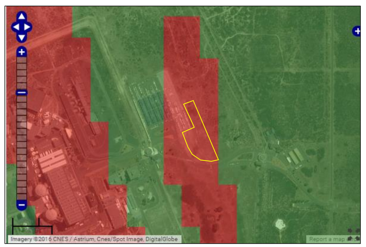
Extract from the SAHRIS Palaeosensitivity map showing the site to overlie an area of high sensitivity (red) in terms of the original geology. The green zones around the site are of moderate sensitivity.