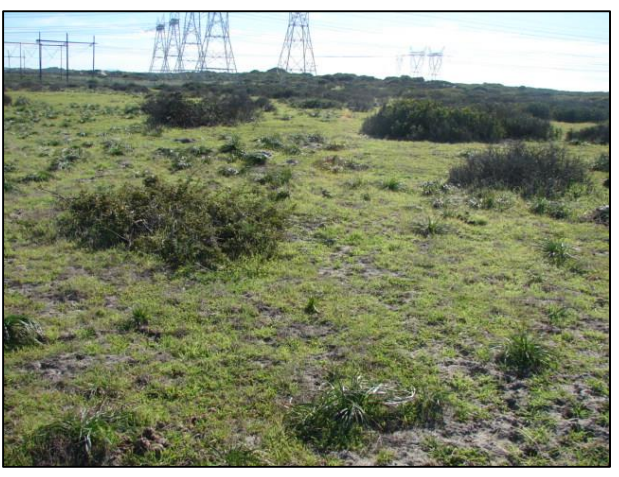
View towards the north with power lines entering Koeberg just to the north of the site.