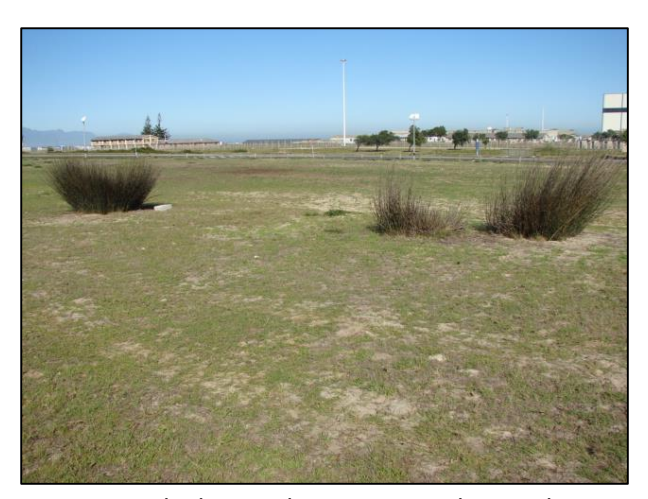
View towards the southwest across the southern part of the site.