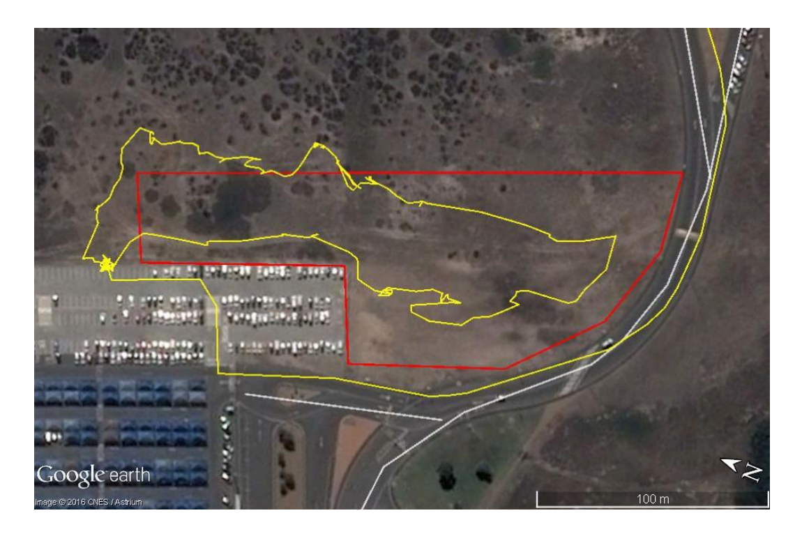
Aerial view of the site showing the walk paths created during the ground survey.