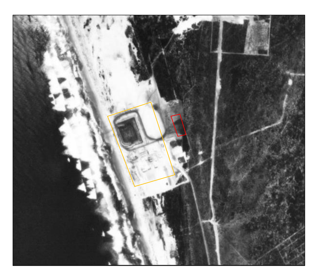
1977 aerial photograph showing the early development of Koeberg Power Station. The orange box shows the location of the main plant site, while the red box shows the location in which the car park lies. It is clear that the surface is disturbed.