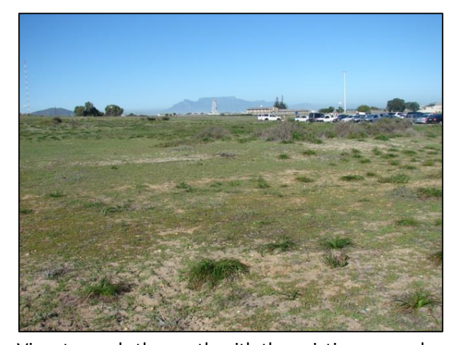
View towards the south with the existing car park visible towards the right.