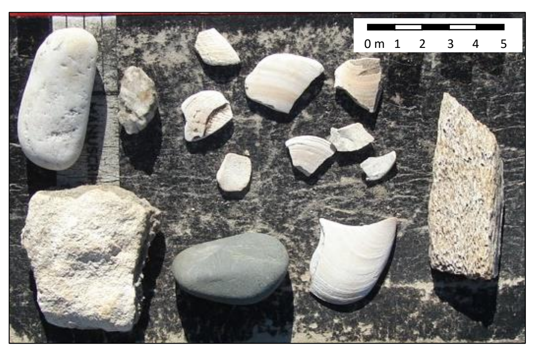
Selection of objects found on the surface of the site. They include pebbles from the Malmesbury Formation, calcrete nodules, white mussel, barnacle and whelk shell fragments and some fossil bones. Note that no whelks and only one bone are in this photograph.