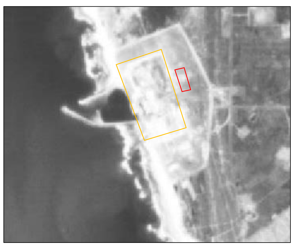
1989 aerial photograph showing Koeberg Power Station. The orange box shows the location of the main plant site, while the red box shows the location in which the car park lies. It is clear that the surface has not yet recovered to look like virgin veld.